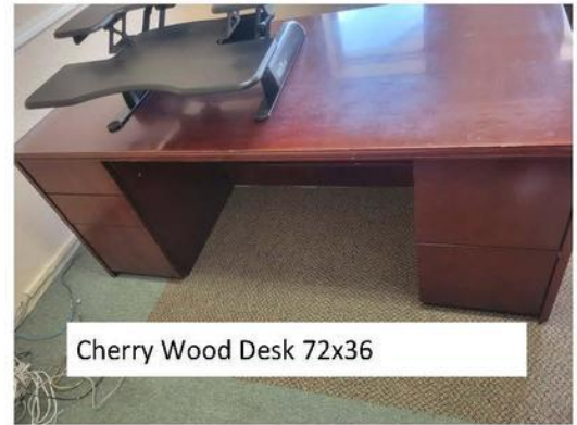
Cherry Wood Desk 72x36