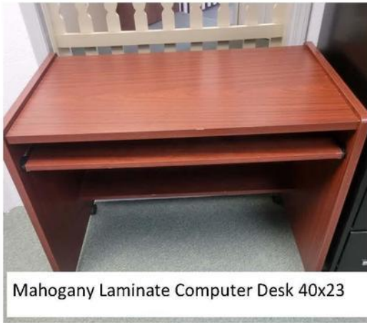
Mahogany Laminate Computer Desk 40x23