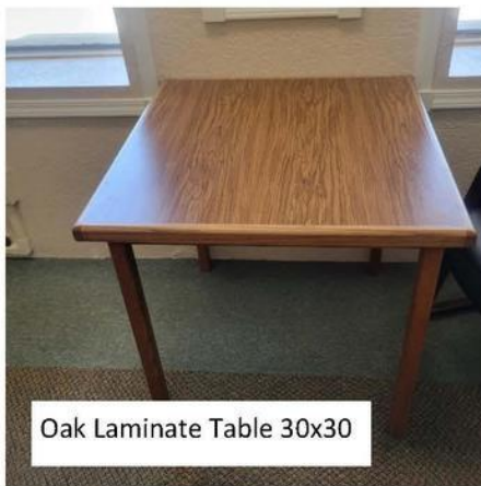
Oak Laminate Table 30x30