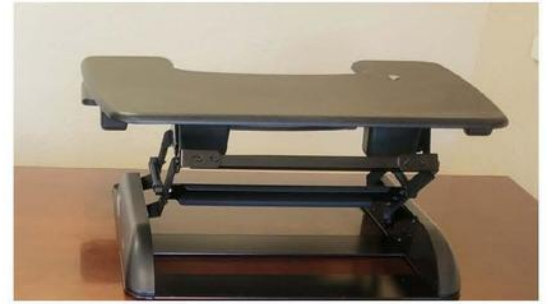
Varidesk Standing Desks 30x30