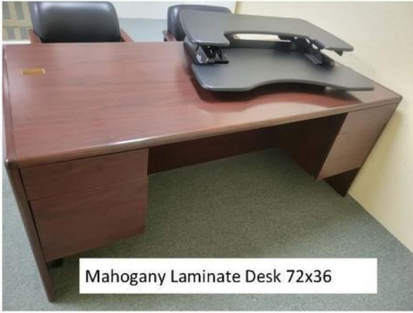
Mahogany Laminate Desk 72x36